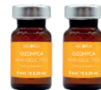
OZONYCA MANDELIC PEEL 2 vials of 6 ml each.