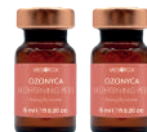
OZONYCA LIGHTENING PEEL 2 vials of 6 ml each.