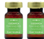
OZONYCA PURIFYING PEEL 2 vials of 6 ml each.